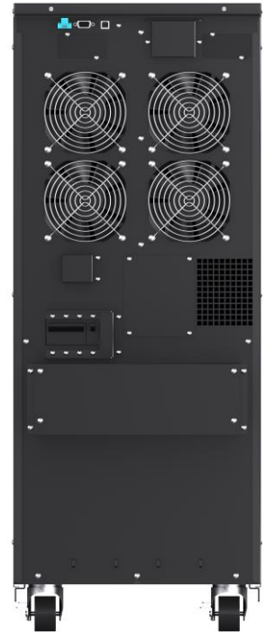
VFI 20000 TP